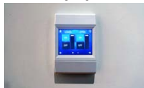
Digital dimmable light controller