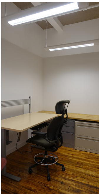
Two private offices