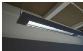
New efficient lighting