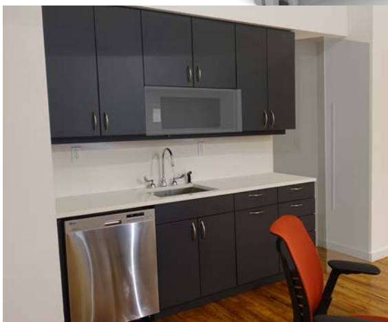
New kitchen with LG dishwasher and pre-wired for a microwave and refrigerator