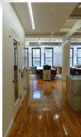
Newly refinished wood flooring