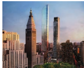
Madison Square Park