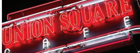
Union Square Café