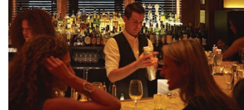
The Clocktower / The NY Edition