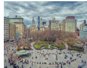
Union Square Park